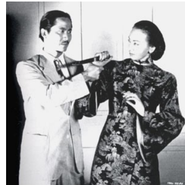
Keye Luke grips the wrist of treacherous Victoria Horne, aka Japanese spy Nabura, in the Universal serial "Secret Agent X-9" ('45).

Keye Luke and Victoria Horne appeared together in the 1945 serial Secret Agent X-9 . The film was about American, Chinese, and Australian agents trying to stop Nazis from obtaining the formula for synthetic fuel. We can only speculate that it was during the filming of Secret Agent X-9 that Keye Luke met Jack Oakie and gifted him with one of his famous caricatures.